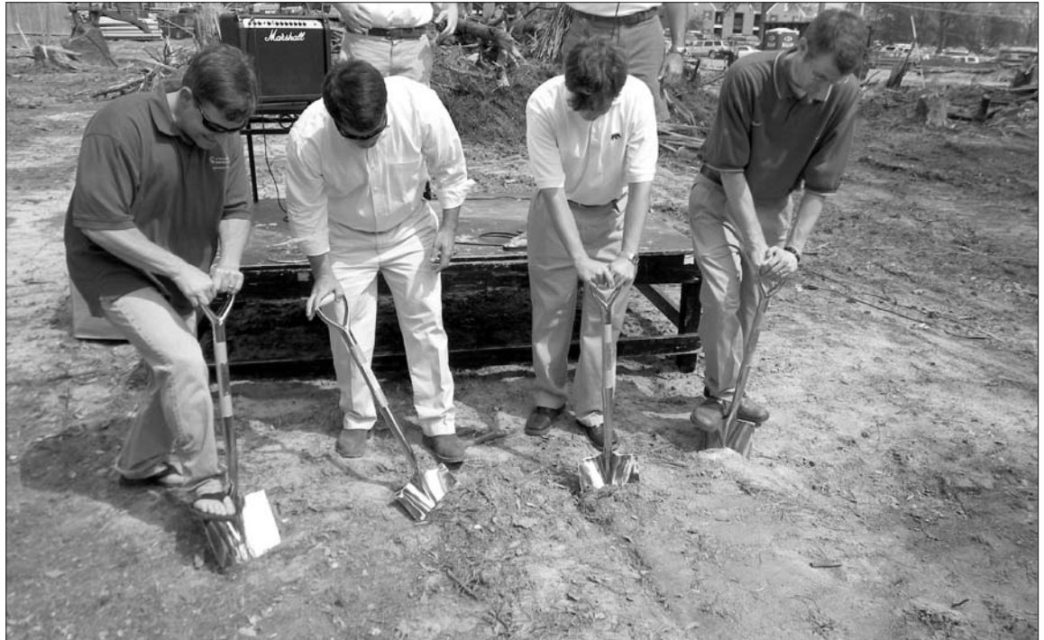
In September, alumni gathered to break ground on the new AKA House.