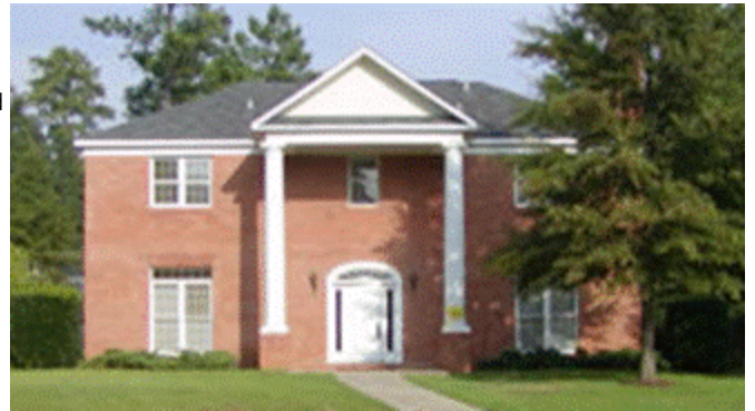
On-Campus House on Devotie Ave, located directly behind the Biology building and Gordon Palmer Hall