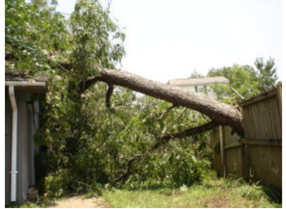
The oak tree at Harbrooke Downs caused approximately $1500 in damages to the off-campus house this summer